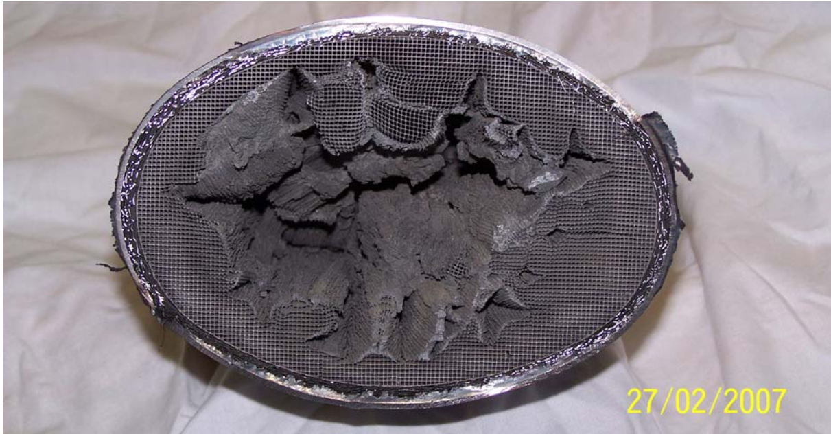
Another example of the same honeycomb completely burnt out through overheating.

One of the legends that abound around our marque was one about a late Silver Shadow that for reasons not recorded ran off the road in America right into a field of very harvestable corn and stopped. The occupants alighted not sure how to escape their predicament only to witness the car suddenly enveloped in a small inferno. They escaped to the road and further witnessed the conflagration of the entire crop and of course the total destruction of the car! The quicker witted among you will have realised the culprit; the muffler on their car was probably literally red hot and had no difficulty igniting a nice under-mattress of dry corn foliage!